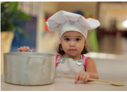
Click on picture for cooking time with dad.

Somewhere around 18 months, your little one might like to start helping you in the kitchen. They can help out with simple tasks such as getting the bowls, spoons, cups, pouring and even mixing.