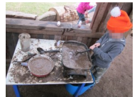
Click picture on how to make a mud pie.

It's starting to warm up outside and after being stuck inside for so long it is time for you to venture out and get some sun. Outside play can be a great way to model the joy of physical activity. Showing your child how to walk on uneven surfaces, balancing, climbing, throwing and kicking a ball, and just exploring the outdoors is a great way to build new learning skills.